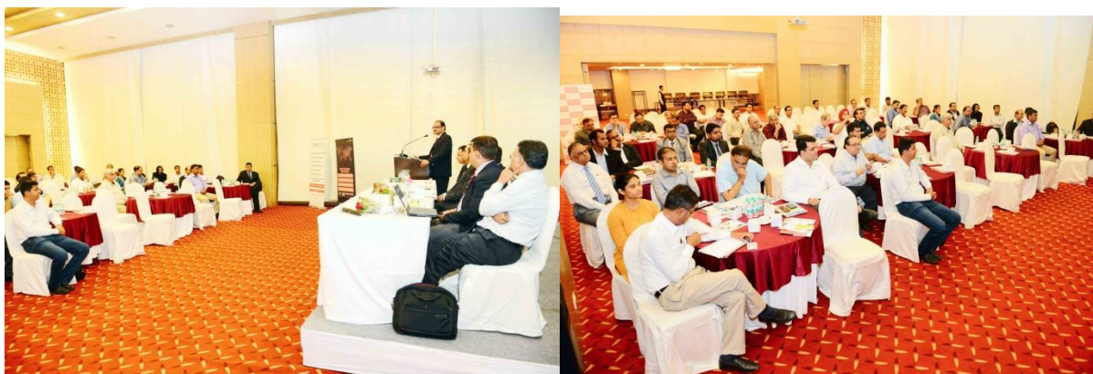
(Invitees listening to the speakers)

Bizexindia along with the BSE SME and World Trade Centre (WTC) organised on 25 th July 2014 the seminar for SME for fund raising and global business opportunities in association with Sarthi Capital Advisors P. Ltd. More than 75 SME corporates attended the event.